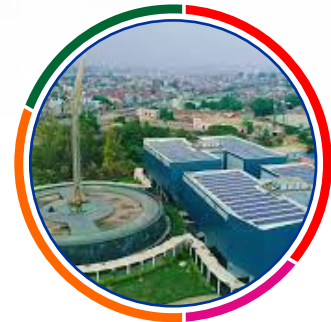
PUNJAB STATE WAR HERO'S MEMORIAL & MUSEUM