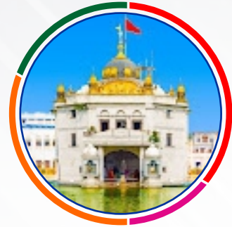
SHRI DURGIANA TEMPLE