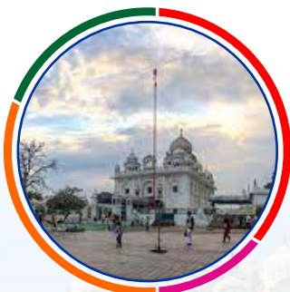
GURUDWARA CHHEHARTA SAHIB