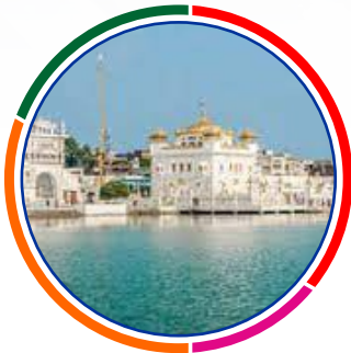
TARN TARAN SAHIB