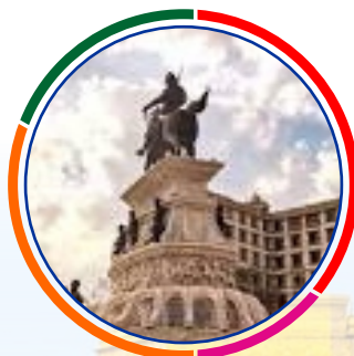
STATUE OF MAHARAJA RANJIT SINGH