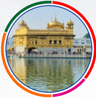
SRI HARMANDIR SAHIB